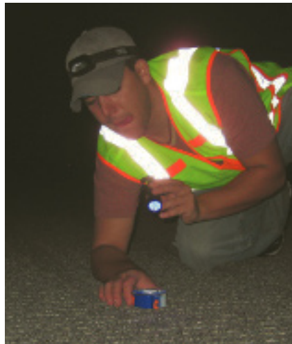
Figure 3: CEAT researcher positions a piece of FOD for nighttime testing

Investigators discovered that the piece of debris on the runway had shredded a tire, causing the accident. While catastrophic accidents such as this one, that have been directly attributed to FOD, are very few, the FAA has recognised that there is still a need to address the problem of FOD to at least minimise damage to aircraft, and more significantly, to prevent another accident from happening.