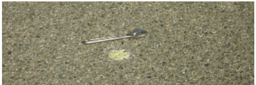
Figure 1: Example of a mechanics tool laying on a runway

For civilian airports, the same concern for FOD exists, but the resources to conduct a military-style FOD Walk just do not exist. Instead, airport operators are limited to regularly scheduled 'airport inspections' where they patrol the airport