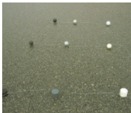
Figure 7: FOD targets of different shades used to evaluate visual detection systems

The evaluations being conducted for each of the different technologies, have presented some interesting challenges that