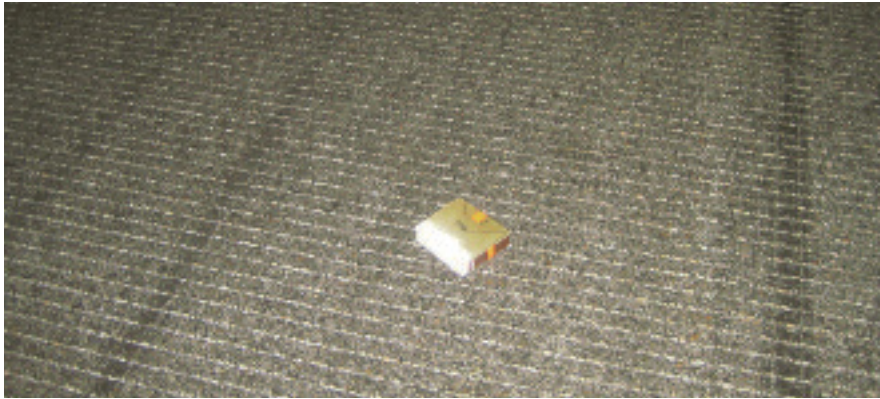
Figure 4: An example of larger piece of FOD being used for blind detection evaluation

The second system to be brought online was the XSight System, trade named FODetect, which was installed at