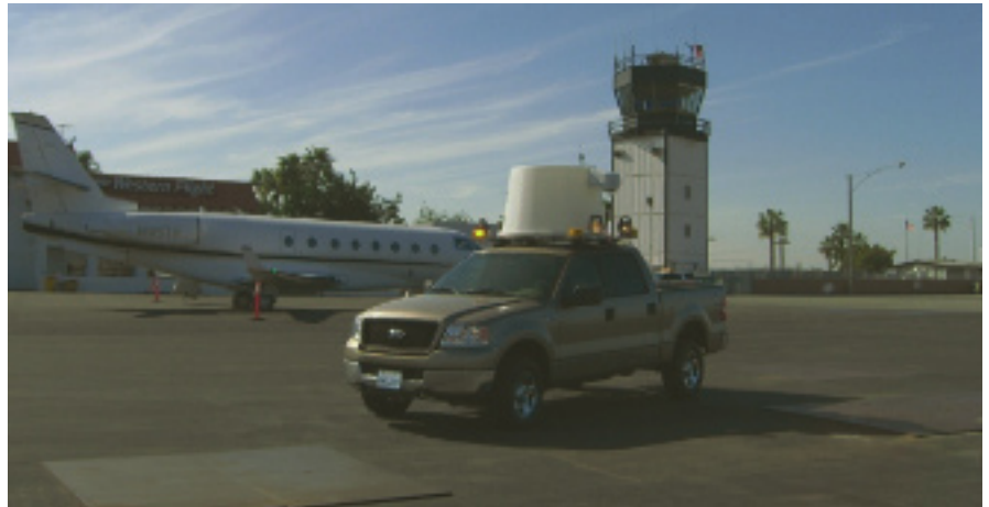
Figure 6: Mobile FOD Detection Technology developed by Trex Enterprises

As the evaluations of each technology continue, the FAA and the CEAT intend to begin drafting a final report. This report