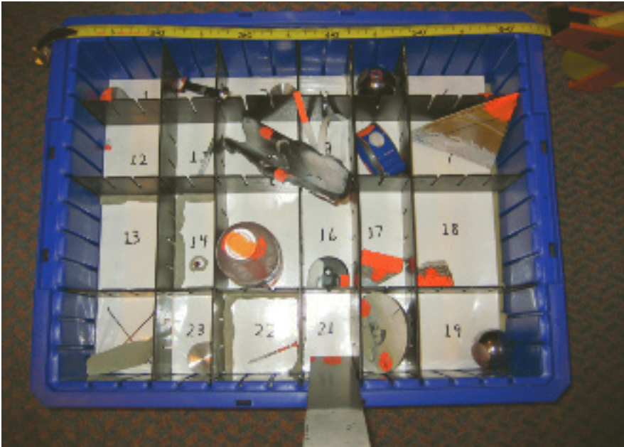
Figure 2: Collection of FOD items used by researchers in evaluation of detection capabilities

surface, visually looking for anything that might be out of the ordinary, including the presence of FOD. As a backup, the airport operators may receive reports from pilots or from air traffic control that a piece of FOD has been seen on the airport's surface. In many cases however, the location and type of FOD are given incorrectly, so the airport operator may spend a significant amount of time searching the reported area. Weather, darkness, and traffic are all components that further complicate the airport operators search for the piece of FOD, thus resulting in what might be viewed as a hasty search; which on many occasions, comes up empty.